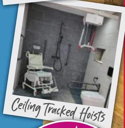
Ceiling Tracked Hoists