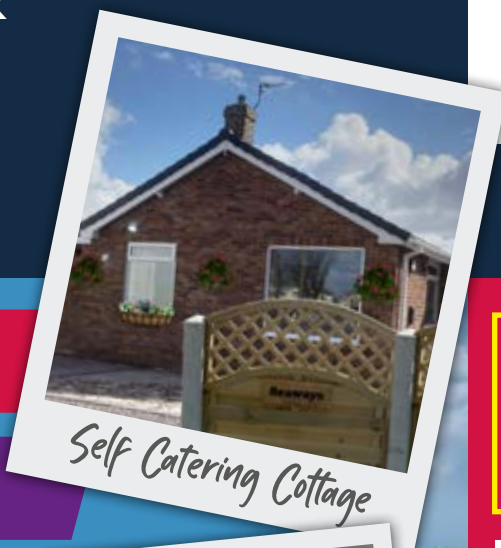
Self Catering Cottage